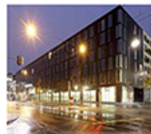
Eurostars Grand Central Nights 8