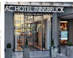
AC Hotel by Marriott Innsbruck Nights 5-7