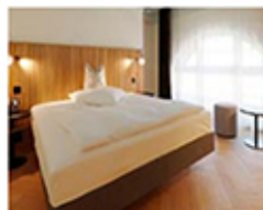
Hotel Bern Nights 1-4