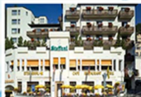
Hotel Steffani Night 7