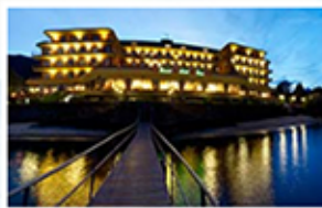
Zacchera Hotels Nights 4-6