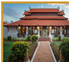
Sriwilai Sukhothai Resort & Spa Nights 4-5