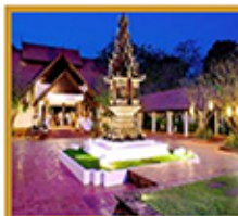
The Legend Chiang Rai Boutique River Resort & Spa Nights 6-7