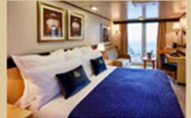
Britannia Balcony $3,552PP Total Price (14) Day Group Package

Call 321-594-0392 to Book with a Deposit Travel Insurance Recommended Tours are Non- Refundable