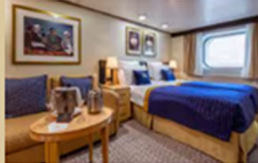
Britannia Oceanview $3,116PP Total Price (14) Day Group Package