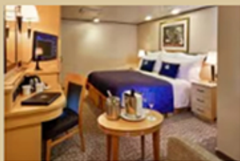
Britannia Inside $2,625PP Total Price (1L) Day Group Package